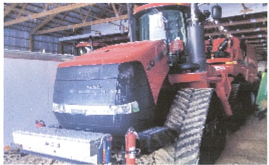
2012 450 Quad